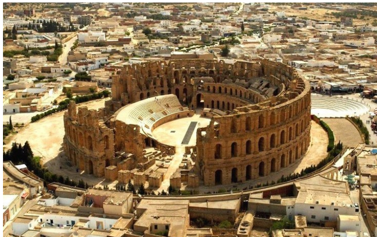
Carthage, the famous ancient city:

https://guide-voyage-tunisie.com/en/sidi-bou-said-town