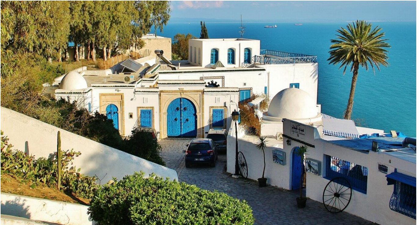
Sidi Bou Saïd, the balcony of the Mediterranean:

https://guide-voyage-tunisie.com/en/sidi-bou-said-town